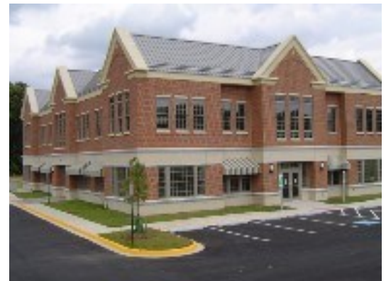
The Realtor Association of Prince William

If you can't make this workshop, check: http://tinyurl.com/SUN-Workshops for additional dates/locations or to access SUN's online, on-demand training.